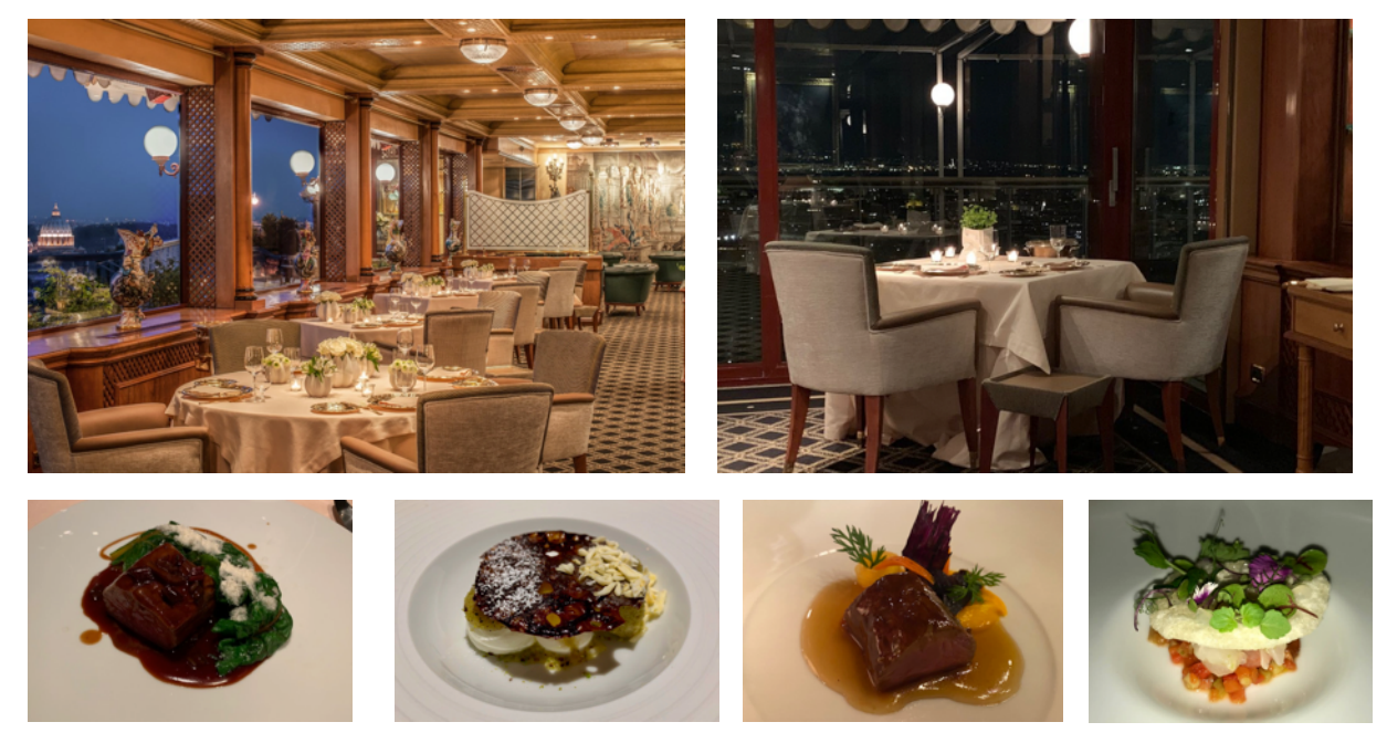
Note: Holiday Dates: Please note that La Pergola closes for 3 weeks in January and 3 weeks in August.

La Pergola is Rome's ultimate restaurant, and has three Michelin® stars to prove it. Every moment at La Pergola is special, from the vermeil plates and cutlery lining your table, to the charming art masterpieces that adorn the walls. Dine on innovative and exciting cuisine, surrounded by classic pieces such as a rare Aubusson tapestry, 18th century bronze candelabra, Sèvres porcelain and a stunning set of hand-blown glass by Emile Gallé. Appreciate the 3 Millennia of history at your feet and the unparalleled views across the Eternal City.